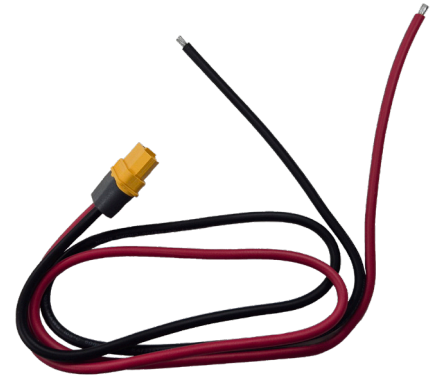
power cable 50cm power lead with XT60 connector