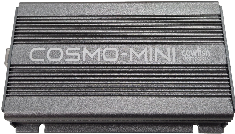
COSMO Mini power supply