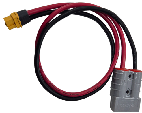
Cigarette plug power cable, or Anderson power cable 50cm power lead with XT60 connector